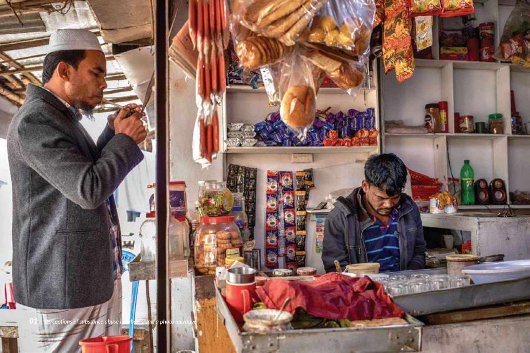
01 | Perceptions of substance abuse in urban slums a photo narrative