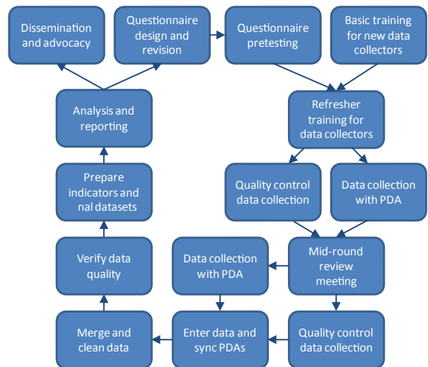
FSNSP schematic diagram

The major activities of the FSNSP include data collection, data management and processing, data analysis and reporting, information dissemination, advocacy and capacity building of the relevant stakeholders. The steps in implementing the project activities are illustrated in a schematic diagram: