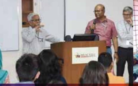
Cumulative Applied Learning®