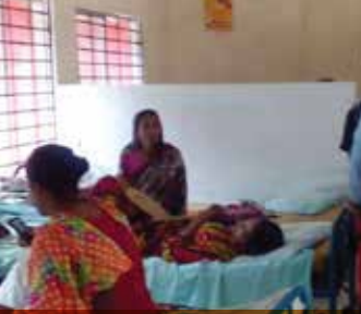
Health Services Interviews, Dialogues and Investigations <sup>®</sup>